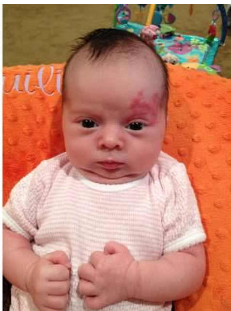
At 2 weeks