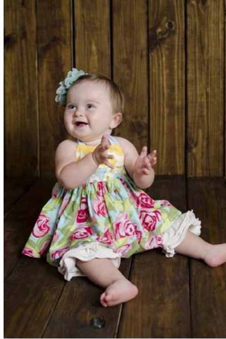
Our “After” at 1 Year