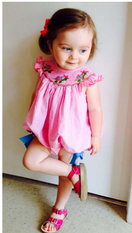
And this is our silly little girl today!