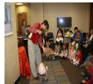
Right: Children in daycare with puppeteer