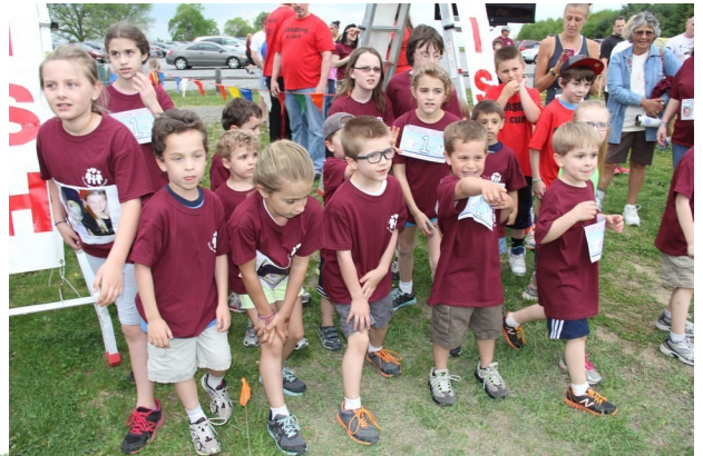
Fun at the VBF 5th Annual Challenge Walk/Run in Niskayuna, New York