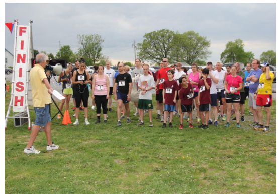
Start of 5K Race in New York