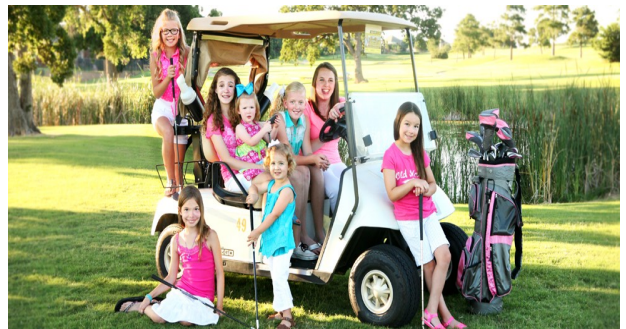
VBF Texas Angel Kiss Birthmark Representatives