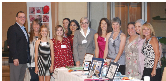
VBF - MAKING A DIFFERENCE Together with the Families, Board Members, Staff, Volunteers, and Donors