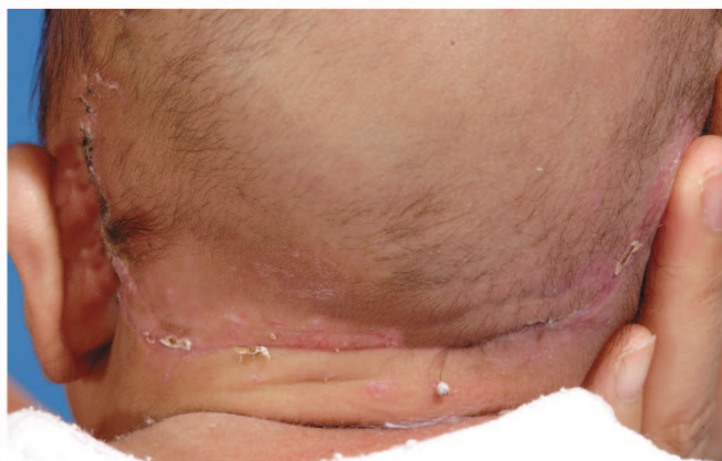
Fig. 3. Case 3. (Left) Photograph of a large ulcerating hemangioma of the left mastoid region. (Right) Postoperative view at 2 months demonstrating a well-healing scar placed along the posterior hairline.

the scalp measuring approximately 4 \times 5 cm. The patient had recently developed a significant bleed from the lesion, and the decision was made to perform complete surgical excision rather than treat the lesion with intralesional steroids (Fig. 3, left ).