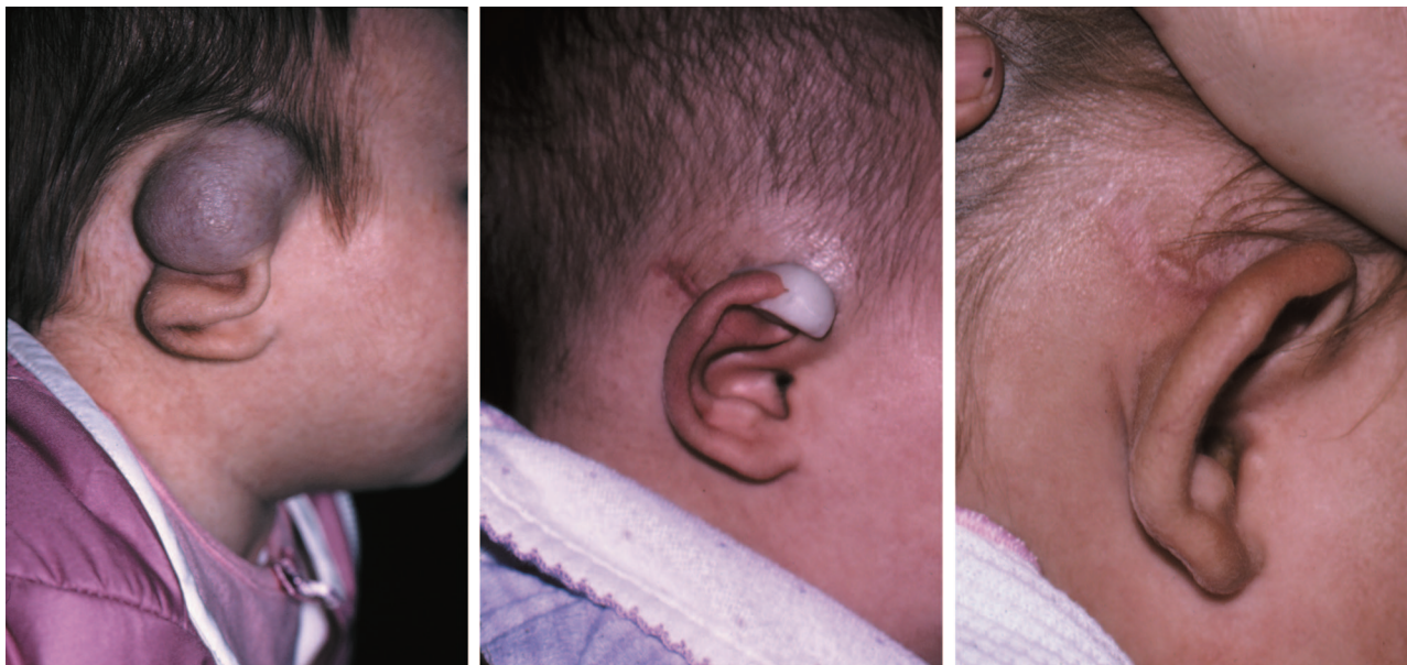
Fig. 6. Case 5. (Left) Photograph of a large hemangioma of the temporoparietal region causing significant deformity of the ear. (Center) Postoperative view showing the Aquaplast mold (Sammons Preston, Boilingbrook, Ill.) in place. (Right) Final postoperative appearance. The ear deformity has been corrected and the scar is well hidden.