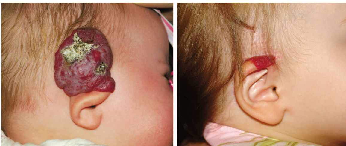
Fig. 7. Case 6. (Left) Photograph of a large ulcerating hemangioma just above and extending onto the right ear. Note the “push-down” deformity. (Right) View of the ear after excision. Note the small portion of the lesion left on the helix to involute.