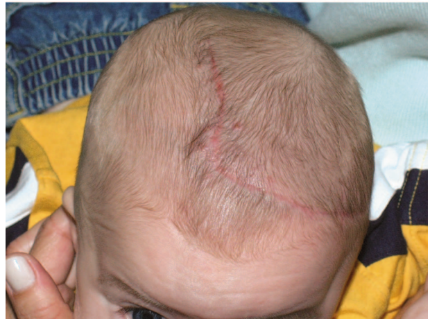
Fig. 1. Case 1. ( Above ) Photograph of a large hemangioma of the vertex of the scalp with a central area of ulceration. ( Center ) Photograph demonstrating the accordion-like properties of the scalp in infants younger than 4 months. ( Below ) Photograph obtained 6 months postoperatively. Note that the scar is completely hidden within the hairline.