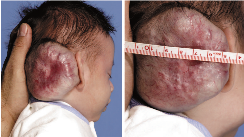
Fig. 4. Case 4. Photograph of a large postauricular hemangioma causing anterior displacement of the ear.